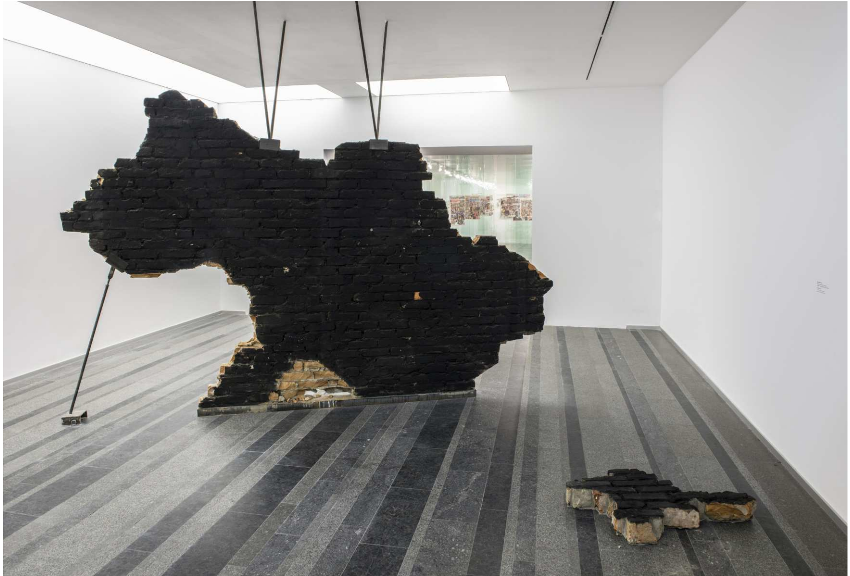
Zhanna Kadyrova – Untitled, 2014, cut out burnt wall, wallpaper, produced by PinchukArtCentre